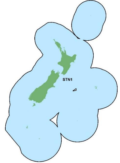
Figure 1: The Quota Management Area (QMA) for southern bluefin tuna (STN 1).