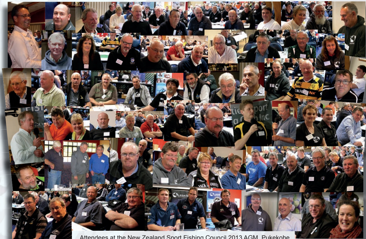
Attendees at the New Zealand Sport Fishing Council 2013 AGM, Pukekohe.