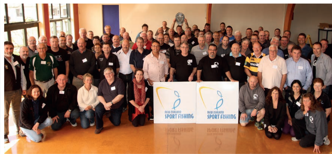
Attendees at the 2013 Annual General Meeting of the New Zealand Sport Fishing Council, hosted by the Counties Sports Fishing Club and held at the Pukekohe Cosmopolitan Club, Pukekohe.