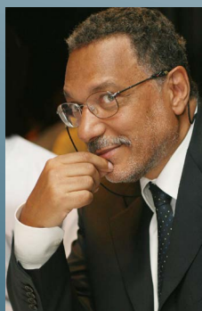
Daniel Pauly Marine biologist Fisheries scientist

Daniel Pauly is a professor and well known for developing the 'shifting baselines' concept and exposing the effects of fishing down marine food webs. Daniel is project leader for the Sea Around Us international catch reconstruction study based out of the University of British Columbia.