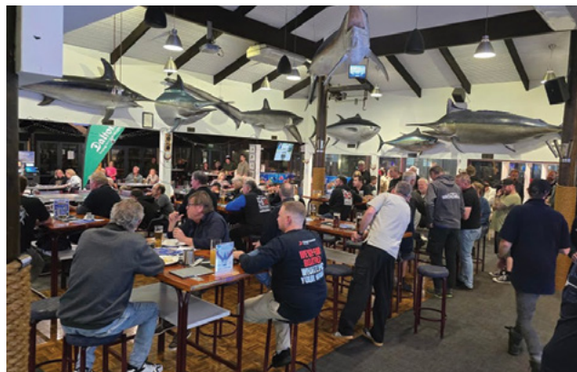
Tauranga had a great night at the first of the Bluefin Tuna Seminars

Social Media: With the Youth Nationals on, we saw some strong growth through our social channels on both Facebook and Instagram . This followed the trend of the previous months of channel growth, with numbers of engagement and followers continually improving.