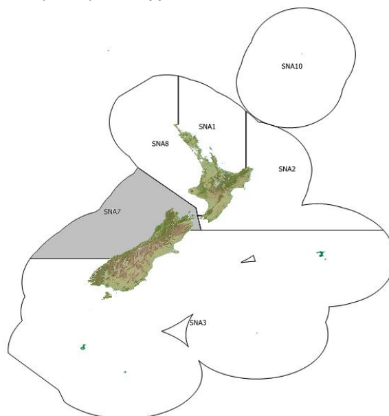
Figure 1: Quota Management Areas (QMAs) for snapper